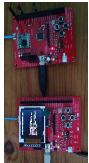
LoRa board prototypes