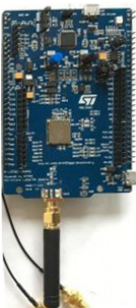
Antenna 868 MHz